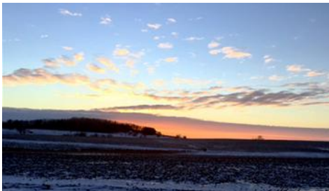
A beautiful sunset on Stagecoach Trail near Apple River, IL.