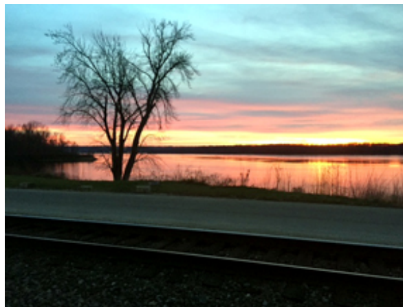
A beautiful sunset along the Mississippi River in Savanna, IL.

As 2015 comes to a close, we would like to thank our members, sponsors, Board of Directors and every one that has taken part in our various programs and services throughout the year. We look forward to continuing these partnerships as we increase our educational programs.