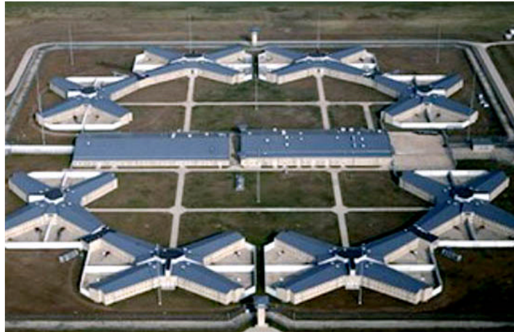
Thomson Prison, Thomson, IL

We lead, advocate, assist and encourage businesses, counties, communities and organizations in Jo Daviess, Carroll, and Whiteside Counties in Northwest Illinois.