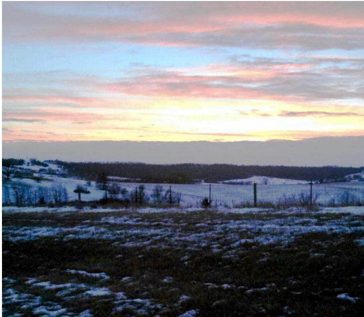
Sunset driving between Elizabeth, IL and Hanover, IL

links to resources and other organizations, photos of our beautiful region, an archive of TCEDA newsletters and whatever catches our attention driving in Jo Daviess, Carroll and Whiteside Counties.